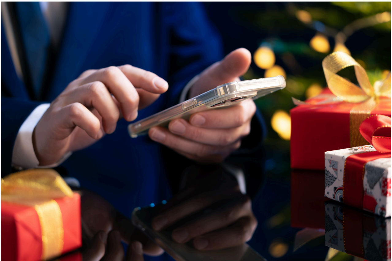
Photo sharing has also become a huge part of the season. Instead of waiting for someone to print photos, everything goes straight to shared albums. Families can upload their own snaps from wherever they are. It's a modern way of keeping everyone connected and makes Christmas memories so much easier to save.

Even Santa has gone digital. Kids can email letters, track the sleigh online, and get personalised video messages. It keeps the magic alive while blending old traditions with new tech.